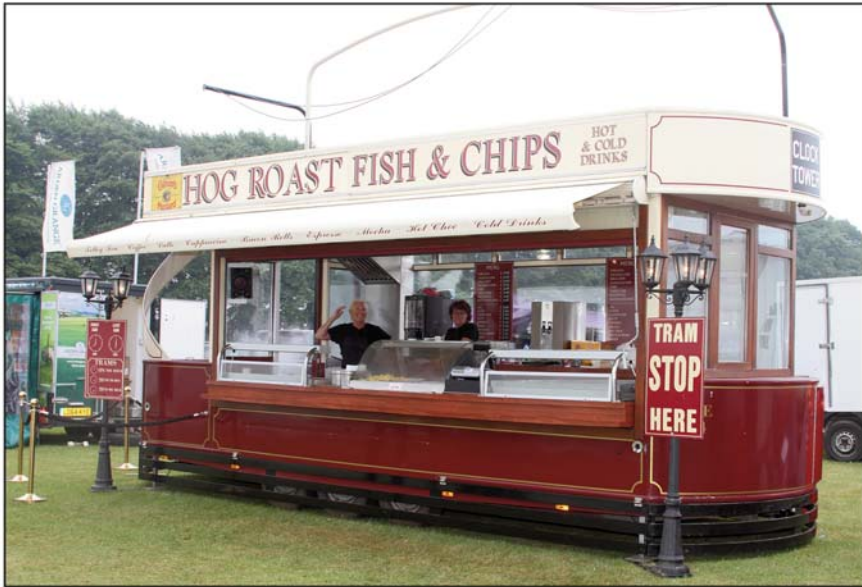
Fully Restored and Converted Blackpool Tram

Catering For All Main Events To The Highest Standard