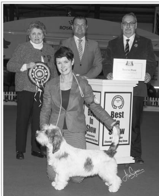
Best in Show 2018

Superb coverage of the show scene in the UK, Ireland & Europe