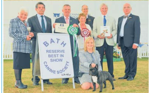
Best in Show & Reserve Best In Show 2018

Superb coverage of the show scene in the UK, Ireland & Europe